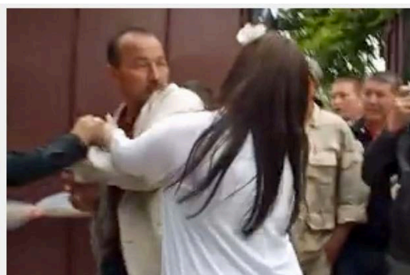
Anti-LGBTI protesters break into the May 17 celebration of the International Day Against Homophobia and Transphobia (IDAHOT) in Bishkek, Kyrgyzstan. Click the image for video.

ISIS recruiting Central Asian migrant workers in Russia, for example, is light on Salafi jihadist theology and extremely heavy on victimization narratives that rail against perceived Western and Jewish conspiracies they claim create the economic hardship faced by non-Slavic migrants in a society mobilized to hate and suspect them by mirrors of these same conspiracy theories (with a different “victim”). This global wave of not just illiberal, but specifically anti-liberal social mobilization with militant and terrorist groups at its extremes – it is readily visible here in the United States and in Europe as well. Populist candidates like Donald Trump or Marie Le Pen inspire enthusiastic support of far-right groups who believe that progressive social policies, immigration, or “multiculturalism” are all part of a global plot to commit “white genocide.”