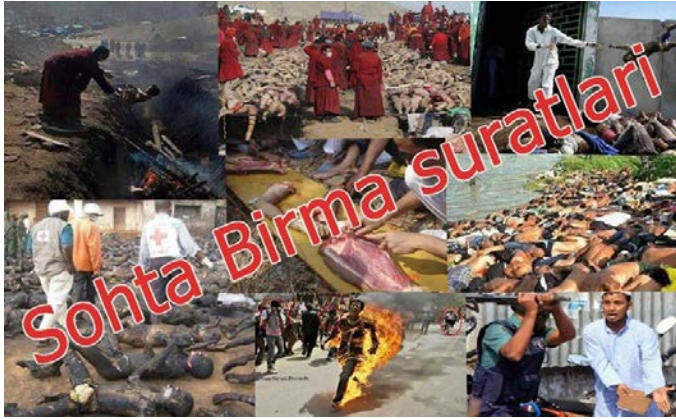
From Facebook, a collage illustrating an article from a popular independent reformist Islamic devotional site warning share the “fake Burma pictures” [Uzbek].

(among its citizens), Central Asian social media feeds are full of fake photographs of Buddhist monks supposedly murdering Muslim babies in Burma, of John McCain shaking hands with Abu Bakr al Baghdadi (the leader of ISIS), or a fake social media account created to post “firsthand testimony” of a Muslim doctor from the Caucasus (who does not exist) who “witnessed” the “brutality of Ukrainian” soldiers against ethnic Russians and claimed it was worse than the Nazi occupation. Fake reports or false information is used within each “us” group to interpret real events, often reversing victimization and reinterpreting